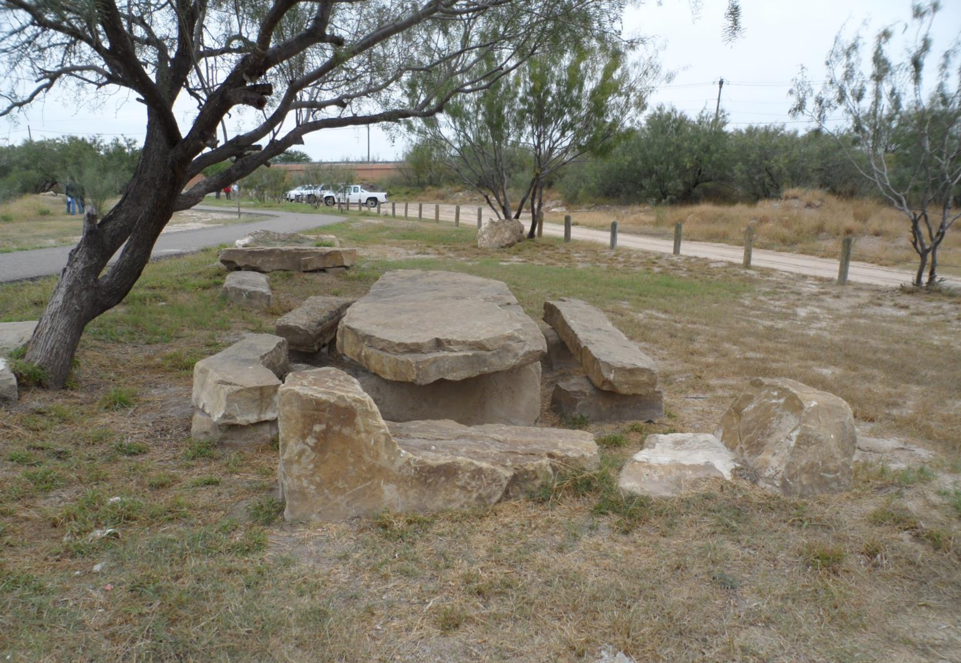
Chacon Creek Hike & Bike Trail