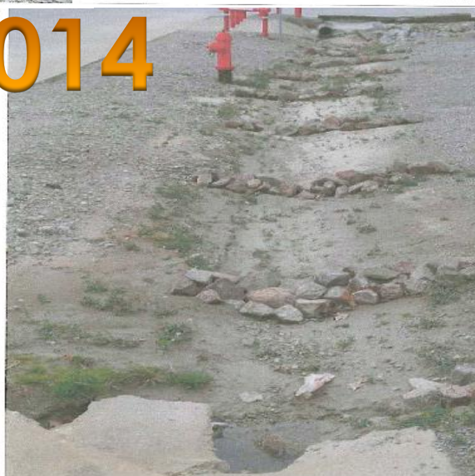
ROCK / CONCRETE SILT BARRIERS AND SEDIMENT BASINS