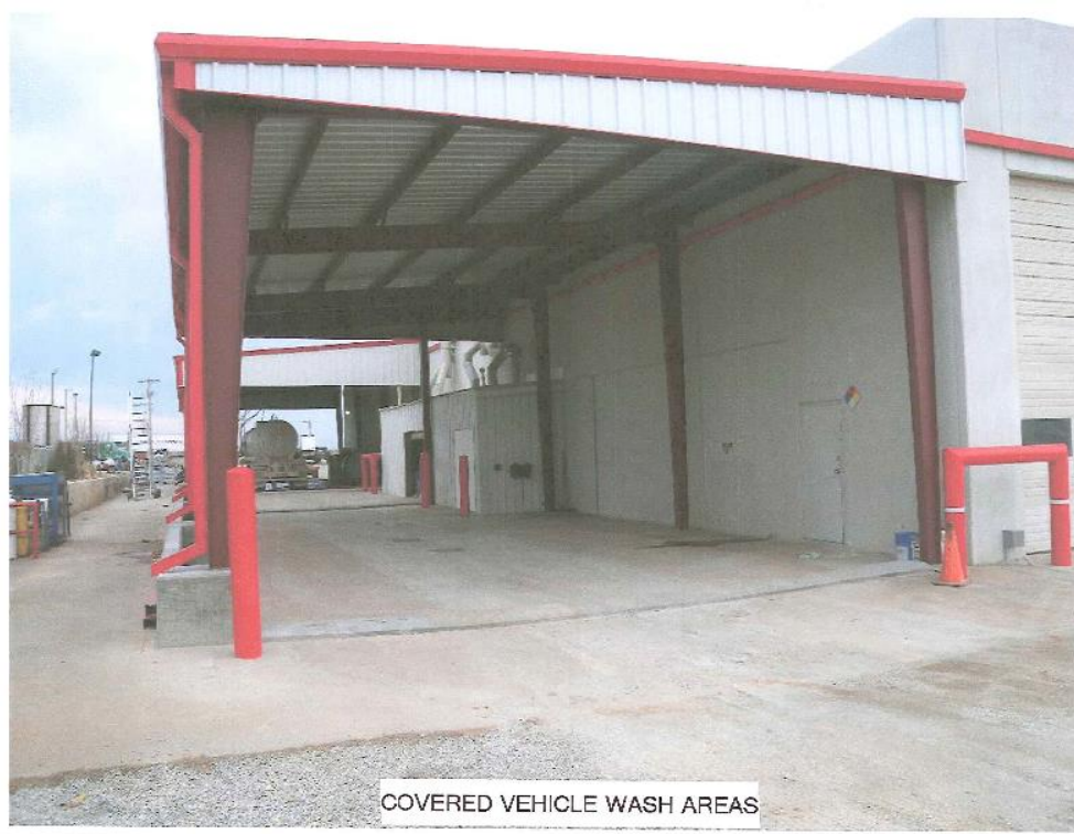
COVERED VEHICLE WASH AREAS