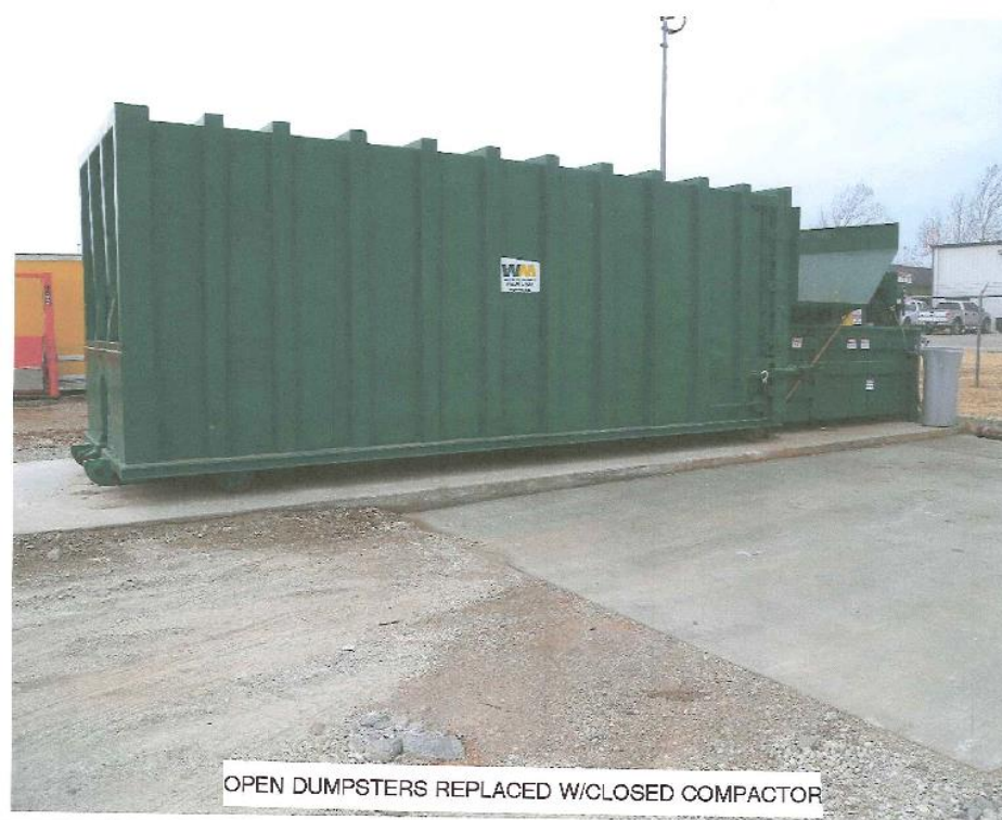
OPEN DUMPSTERS REPLACED W/CLOSED COMPACTOR