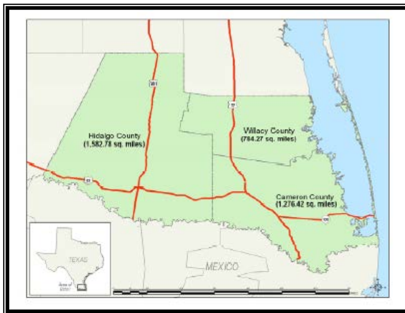
Figure 1-1: Lower Rio Grande Valley Project Area (LRGVDC, 2003)

The Lower Rio Grande Valley (LRGV) is growing at an incredible rate and by the year 2020 it is estimated that the population will exceed 1.6 million people (LRGVDC, 2003). The 2000 U.S. Census indicated that the population of the LRGV (Figure 1-1) was 924,772, and according to the Texas Water Development Board (TWDB), the population of the Rio Grande Region M (Figure 1-2) will increase by 142% by the year 2060. The population boom in South Texas has forced decision-makers to prioritize environmental concerns due to lack of local, state and federal resources. The top three concerns identified by the Texas Commission on Environmental Quality (TCEQ) in the Lower Rio Grande Subregion are water quantity, water quality, and illegal dumping of municipal solid waste (TCEQ, 2002).